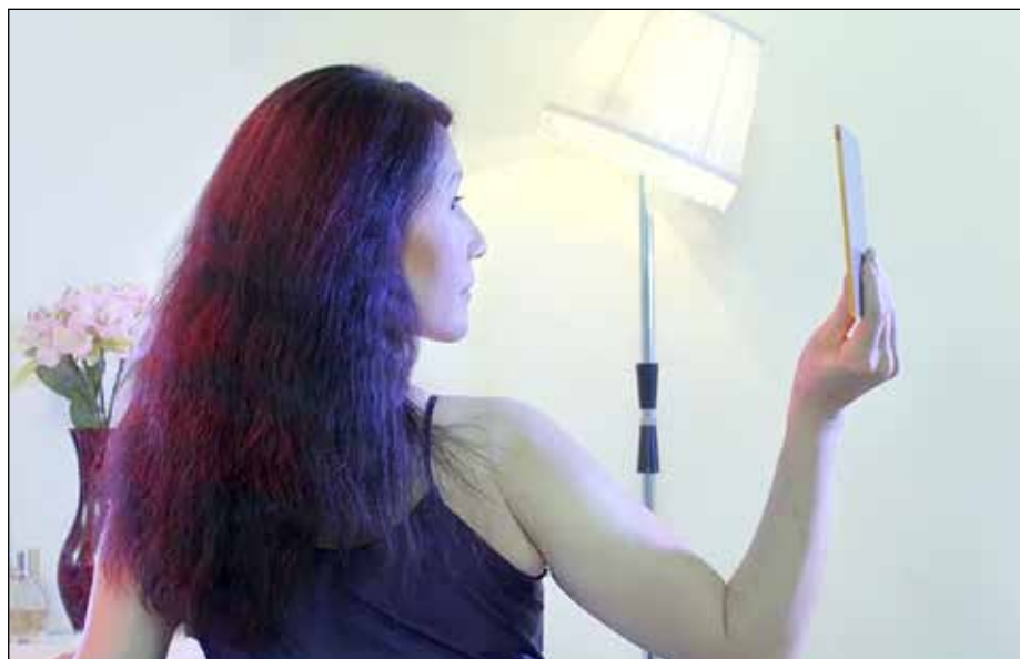
Shards from the Mirror of History, April 4