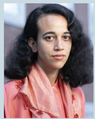
THURSDAY, FEBRUARY 17, 6:00PM THE FILMS OF NAZLI DINCEL

2015-2018 USA, Turkey, Argentina, 66 min. In English / Format: 16mm and Digital Video